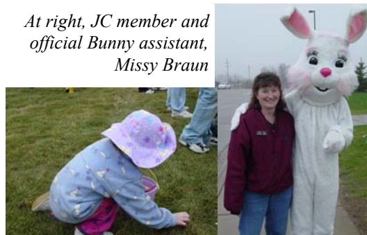
This year's hunt was another success! We estimated about 300 people! The rain held off and the kids found lots of candy and prize eggs.