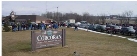
Last year's hunt...lots of people! The older kids ready to hunt to the left and the younger kids off to the right (behind the row of cars).

Lots of candy and prizes awarded! Come see the Easter Bunny and get a few treats!