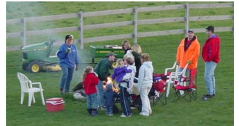
Relaxing by the fire at Cece's after an evening of ditch clean-up.